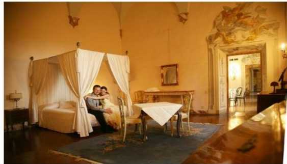
Play lord and lady of the manor and honeymoon in a medieval 13th century Tuscan castle.

Rolling Italian hills, 13th century medieval castles and lush green gardens are at the height of honeymoon romance. Combining a historic setting with the rustic charm of rural Tuscany is exactly what our third luxe honeymoon destination offers. If you fancy playing lady of the manor and snuggling up with your newly-crowned spouse in splendidly detailed rooms, Castello di Meleto was designed for you.